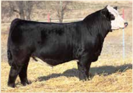
W/C Loaded Up 1119Y

There would be 179 calves to choose from that will be born in 2018 and you can choose either a heifer or a bull but the pick needs to be made by October 1, 2018.