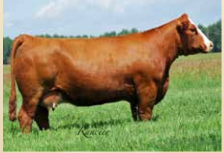
RF Scream 215Z