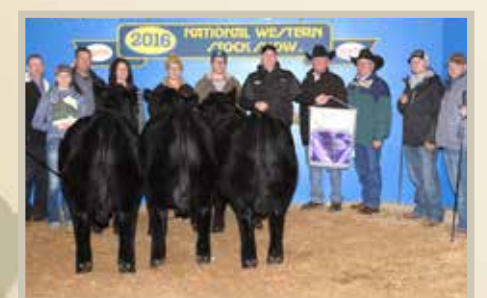
Rust Mountain View Pen of SimAngus Bulls 2016 NWSS Champion Pen of Bulls