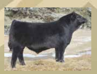
SVS Captain Morgan Full sib to dam of 518C