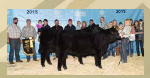
LFE BS Shiela 82A FarmFair Grand Champion Female