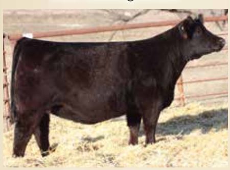
WC Angel 5870C