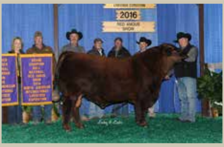
Damar Trump C512 2016 NAILE Grand Champion Bull