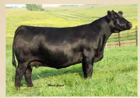
Miss Werning 8543U