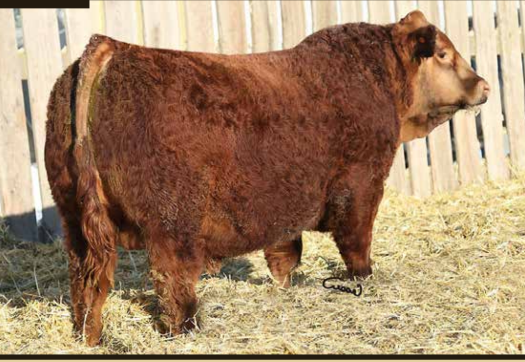
The Canadian phenom whose first daughters topped every sale they were in!

LOT 4A - 10 units of WFL Westcott 24C semen LOT 4B - 10 units of WFL Westcott 24C semen LOT 4C - 10 units of WFL Westcott 24C semen LOT 4D - 10 units of WFL Westcott 24C semen LOT 4E - 10 units of WFL Westcott 24C semen ****USA semen only, the only semen offered in USA in 2018