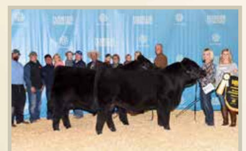
LFE Violet 641A FarmFair Grand Champion Female