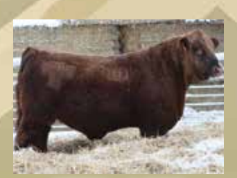
LFE RS Lewis 349C Son of Big Time 86A