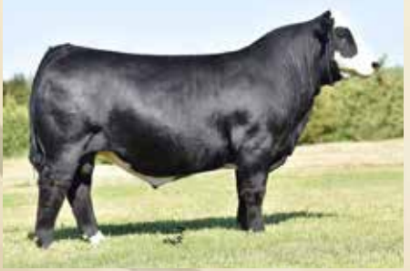
W/C Bankroll 811D