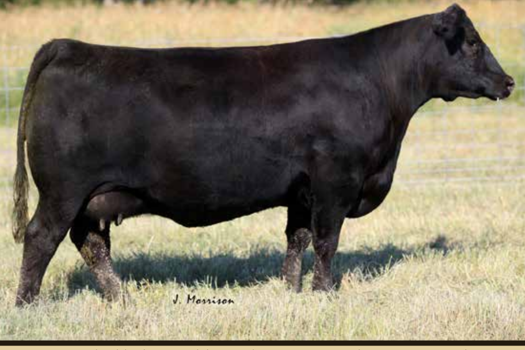
1299 is a highly decorated donors that is an extremely consistent producer