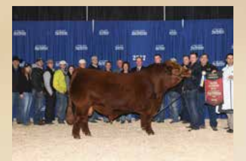
BGS/BM Captain Scream 63D