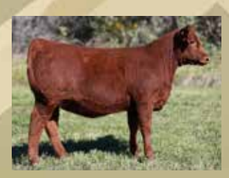
Rust Miss 6226D Daughter of U147