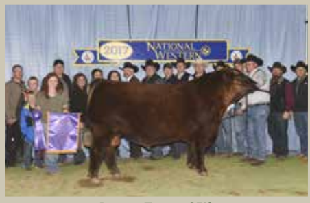
Damar Trump C512 2017 NWSS Grand Champion Bull