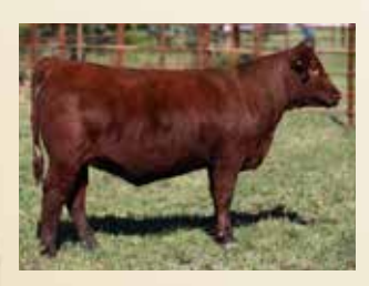
Rust Miss Rhonda 7218E Daughter of Rhonda 5109