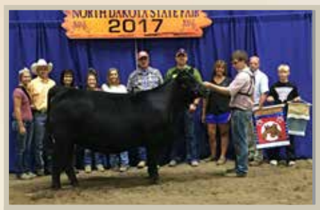
S A V Polly 6539 North Dakota State Fair Grand Champion Female