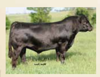
Yardley High Regard W242 Sire of Peppa 110C