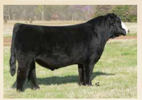
TJSC GCC Boone Pickens 46C