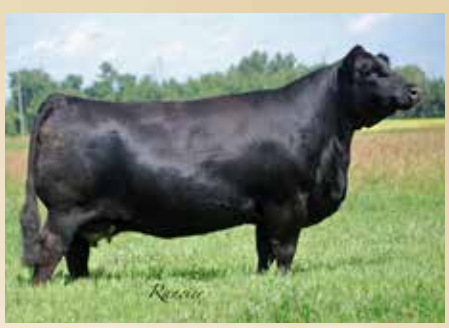
RF Certainly Flirtin 202Z