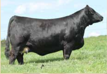
LFE BS Violet 641A

Offering pick of any bull or female born at Rust Mountain View Ranch from their 2018 Simmental, SimAngus and Angus calf crop.