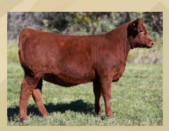
Rust Miss 6226D Daughter of U147