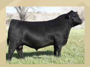
S A V Raindance Dam is a full sib to 6566