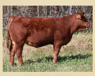
Rust Miss 507C High seller in '15 Rust Sale

LOT 27 - 5 Embryos of NUG Royal Red 324A x BEECH Bros Yara 122Y