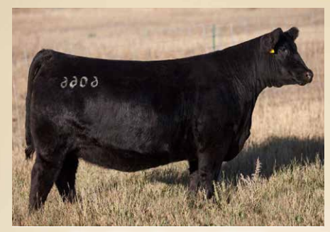
Brooking Beauty 6066