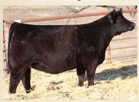
WC Angel 5870C