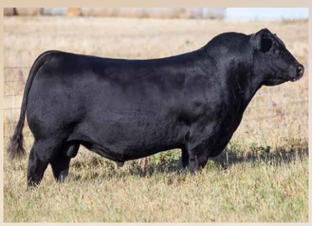
Brooking Bank Note 4040