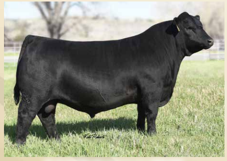
SAV Raindance 6848