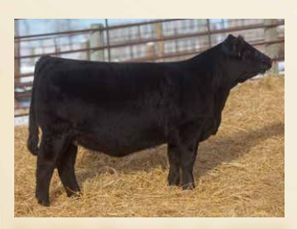
Rust Miss Dream Locked 809F Commissioner daughter