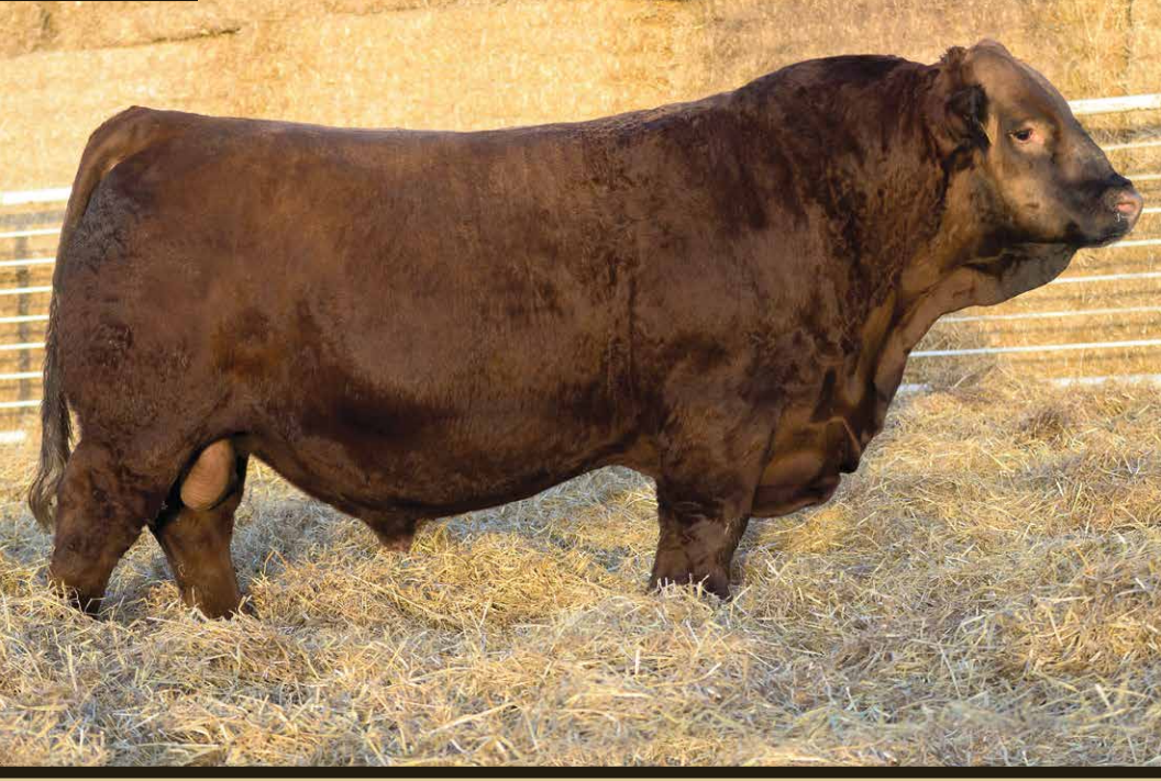
The Canadian phenom that has escalated marketability through power & quality

LOT 15A - 10 units of WFL Westcott 24C LOT 15B - 10 units of WFL Westcott 24C LOT 15C - 10 units of WFL Westcott 24C LOT 15D - 10 units of WFL Westcott 24C LOT 15E - 10 units of WFL Westcott 24C ** USA semen only, the only semen offered in 2019.