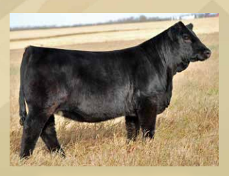
RF/MCC/CD Flirt 770E $32,000 Westcott daughter