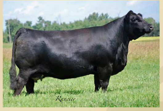
RF Certainly Flirtin 202Z Grandam that has produced $550,000 in progeny

RF/Rust Flirt 827F :: Full Sister to Lot 4 Supreme Champion at FarmFair Legends of the Fall