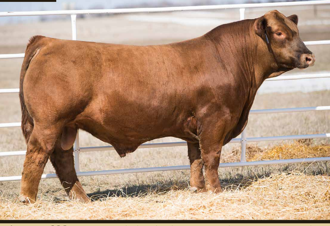
Awesome EPD's, impressive look and pedigree wrapped into an exciting package

LOT 13A - 10 units of W/C Depth Charge 0266E LOT 13B - 10 units of W/C Depth Charge 0266E LOT 13C - 10 units of W/C Depth Charge 0266E LOT 13D - 10 units of W/C Depth Charge 0266E LOT 13E - 10 units of W/C Depth Charge 0266E ** USA semen only, the only semen offered in 2019.