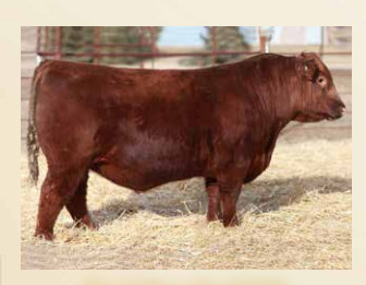
Rust Granite 100D W14 son sold to Yackley