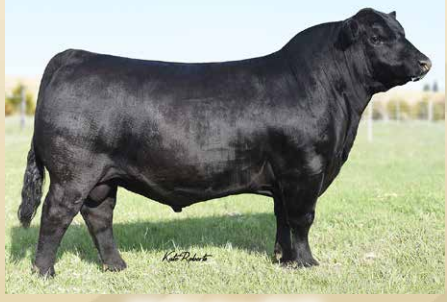
KR Casino 6243

Lot 2A - Offering pick of any female born at Rust Mountain View Ranch from their 2019 Angus calf crop.