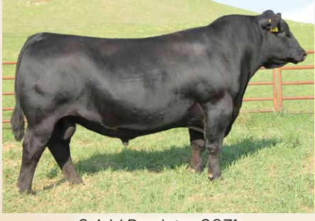
SAV Registry 2831

We have been working on building a purebred Angus program from the most sought after genetics in North America. Through progressive flushing, we will have 60 Angus ET calves born in December, January and February. The donors and bulls pictured above are an example of the very best genetics available and we fully stand behind these genetics 100%!There would be 60 calves to choose from that will be born in 2019 and the pick needs to be made by October 1, 2019. We will also supply one plane ticket for the individual coming to make the selection, along with the pickup at the airport and dropoff.