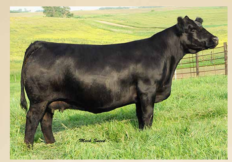
Miss Werning 8543U