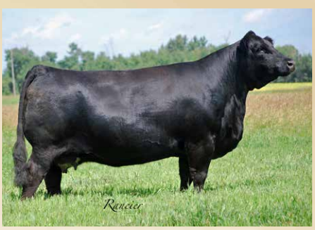
RF Certainly Flirtin 202Z