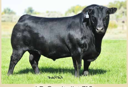
LD Capitalist 316