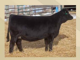
Rust Miss United Dream 821F Commissioner daughter

LOT 30 - 5 Embryos of Rust Commissioner 42D x W/C Miss Werning 531C