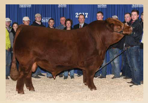
BGS/BM Captain Scream 63D