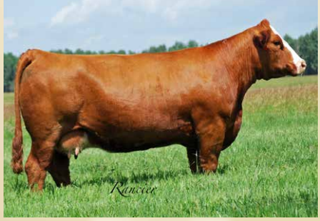
RF Scream 215Z