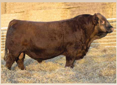
WFL Westcott 24C