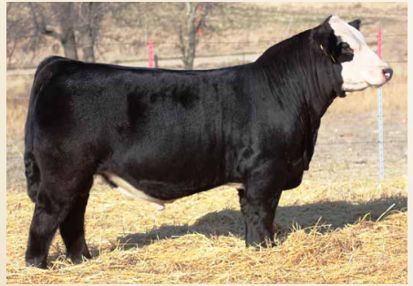
W/C Loaded Up 1119Y

There would be 200 calves to choose from that will be born in 2019, 100 being embryo transfer calves. The pick needs to be made by October 1, 2019.