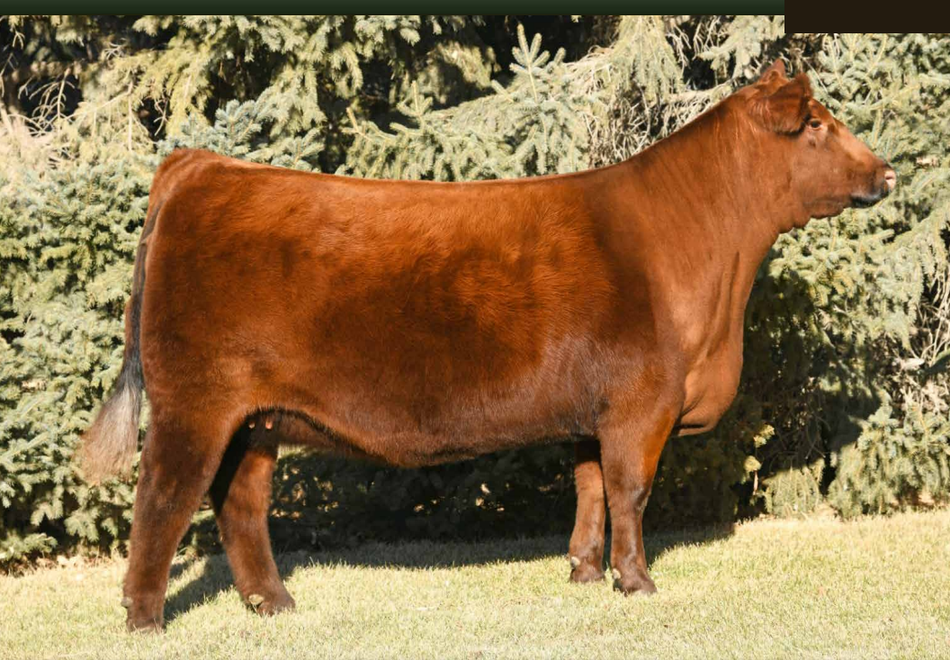
Awesome opportunity with a great cow family in the Lakota's with exciting matings

LOT 20A - 3 Embryos of Red Soo Line Power Eye 161X x Rojas Navarre 6054 LOT 20B - 3 Embryos of Damar Trump C512 x Rojas Navarre 6054 LOT 20C - 5 Embryos of Damar Next D852 x Rojas Navarre 6054 *** Lot 20C is exportable to Canada