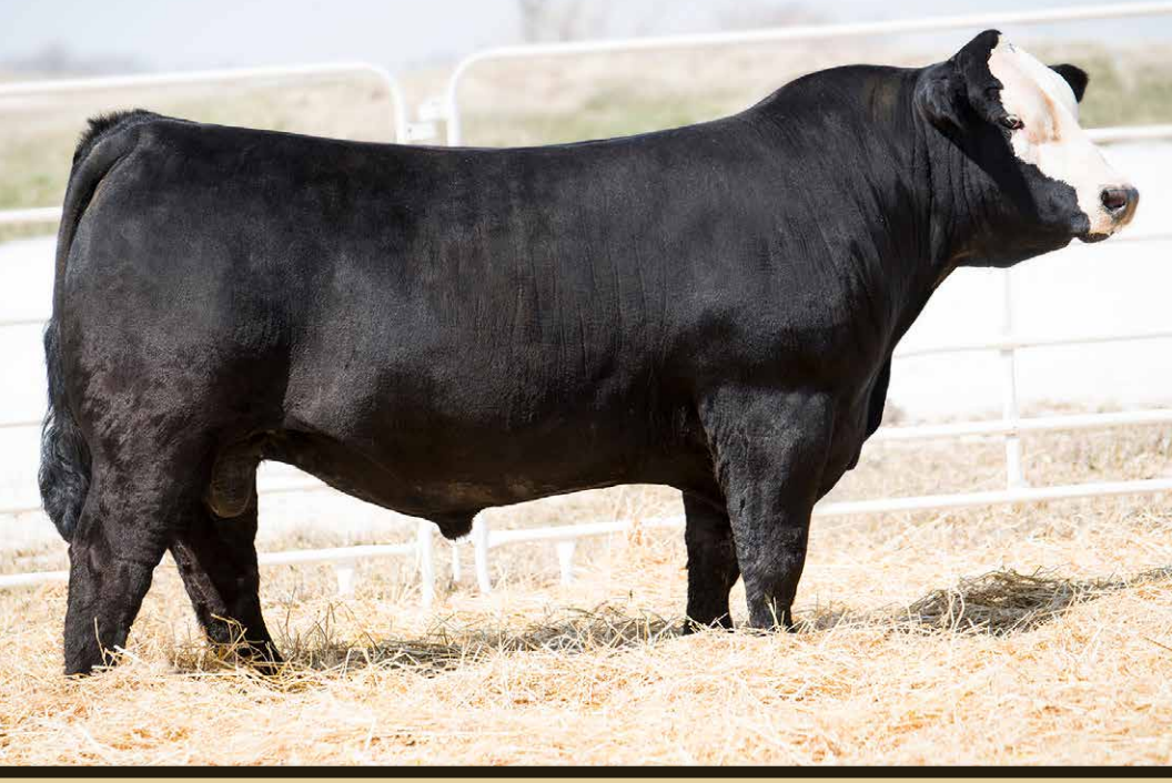
Lead bull in 2017 NWSS Res. Grand Champion Pen with outstanding pedigree

LOT 14A - 10 units of VCL LKC Profit Maker 604D LOT 14B - 10 units of VCL LKC Profit Maker 604D LOT 14C - 10 units of VCL LKC Profit Maker 604D LOT 14D - 10 units of VCL LKC Profit Maker 604D LOT 14E - 10 units of VCL LKC Profit Maker 604D ** USA & Canadian semen only, the only semen offered in Canada in 2019.