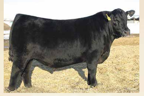
SAV Cut Above 6271