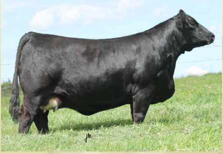
LFE BS Violet 641A