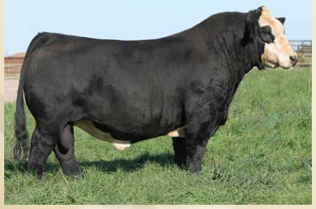
W/C Bankroll 811D