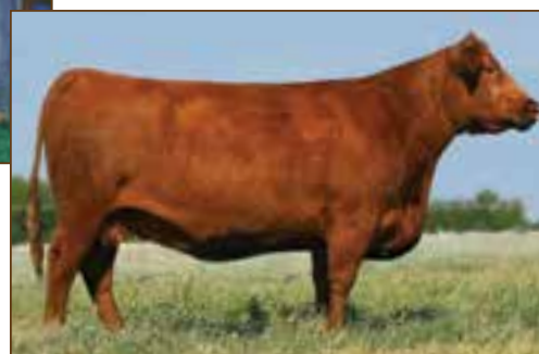
AHL DUCHESS 42W