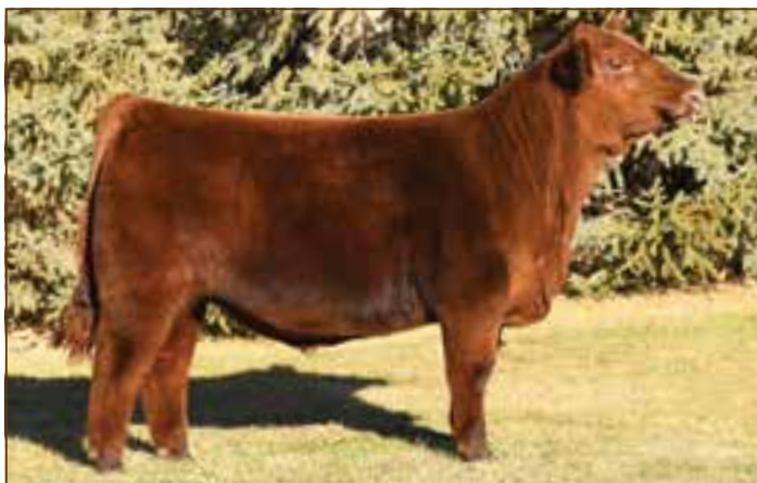
RED BLAIRS SIGNAL