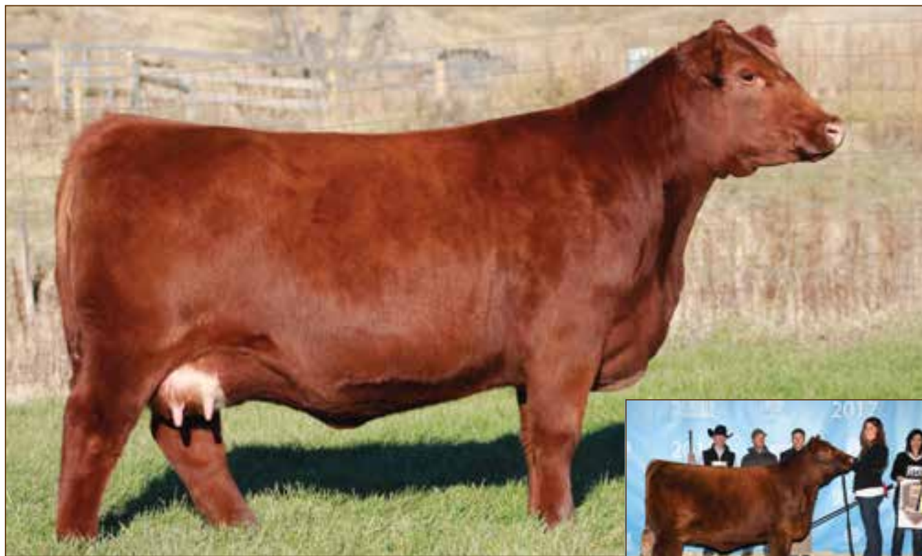
SIX MILE WIND CHIME 689D • Daughter of Lot 25 Dam