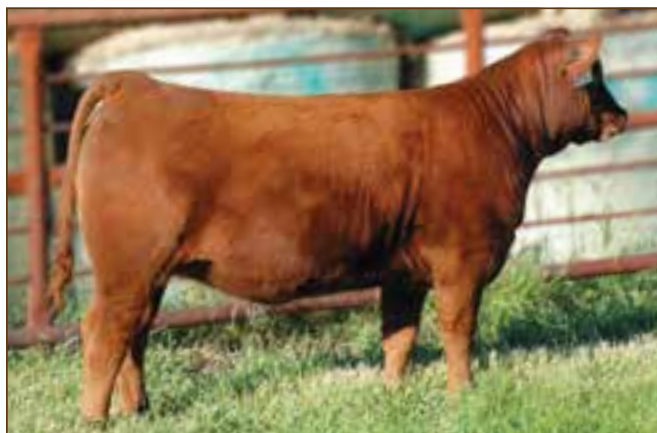
RED SSS STOCKY 249B