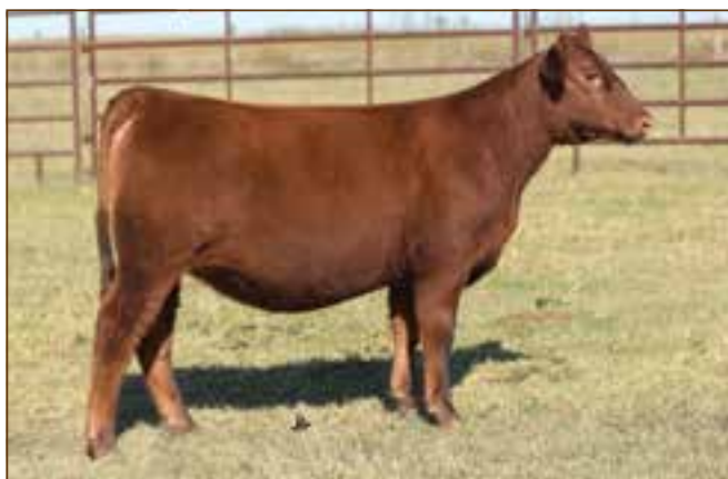
Daughter of Lot 18

BUF CRK CHIEF092-824 BFLO CRK CARIE VC473 LMAN ROBIN HOOD 1174B KRN REBELLA 805/314 BJR HI HO 916 BECKTON EOLA 2025 CB LARSON RED LIGHTNING FED'S BLOCKANA 4231