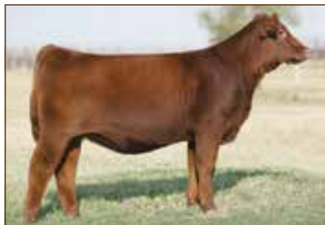
BAR-E-L TOO TOO 218C

TERMS: Half purchase price due sale day. Remaining half purchase price due when selection is made