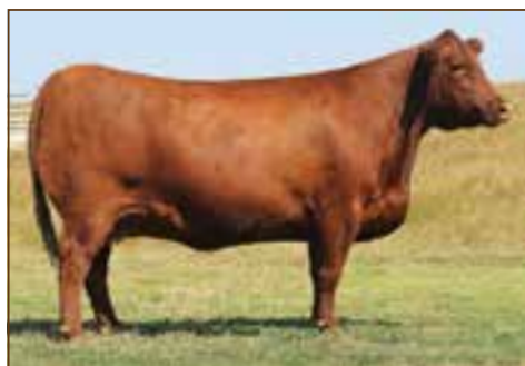
NSFR MTX W14