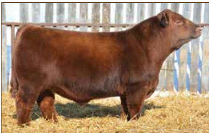
RED BLAIRS GLADIATOR 541B