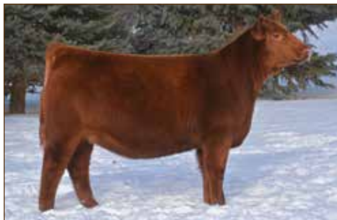
RED BLAIRS KASSIE 727D