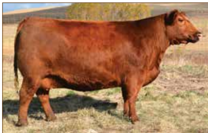
RED SIX MILE LAKOTO 35W

Our recent Genetic Focus Sale in December 2017 averaged more than $17,000 per female and our bull sale sees high demand for our range produced bulls. This is a testament to the kind of females offered here.