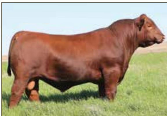
PIE UPFRONT 508

Half purchase price due sale day. Remaining half purchase price due when selection is made