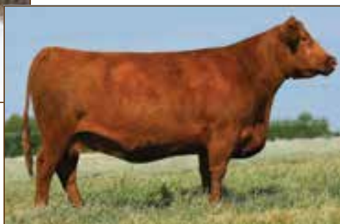
AHL DUCHESS 42W Dam of Lot 10