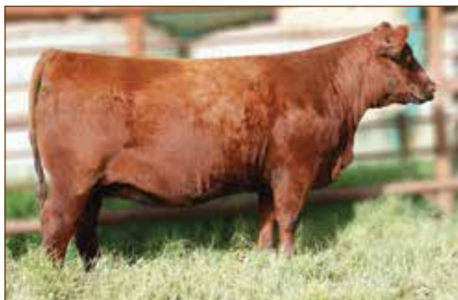
RED SSS NELLIE 143B