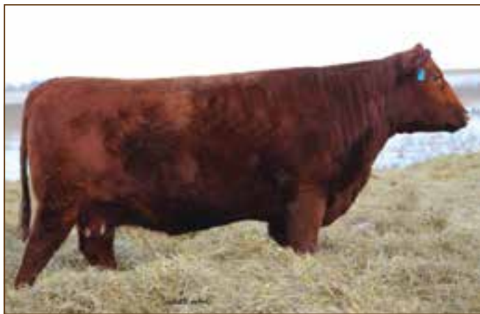
BASIN PRIMROSE 0T43