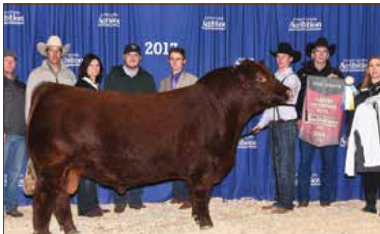
WEBER REFORM 618 • Grand Champion 2017 Agribition