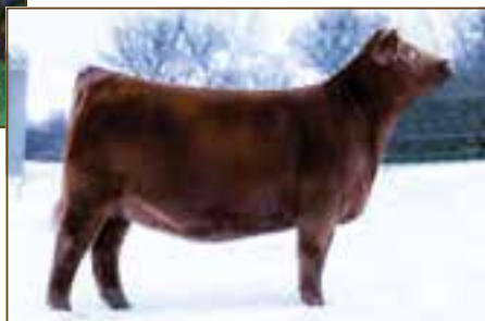
DAMAR BARCELONA E067