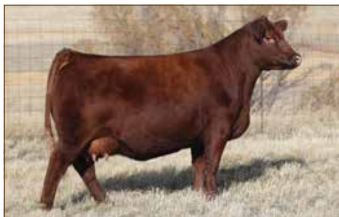
RED SIX MILE MARTA 238C