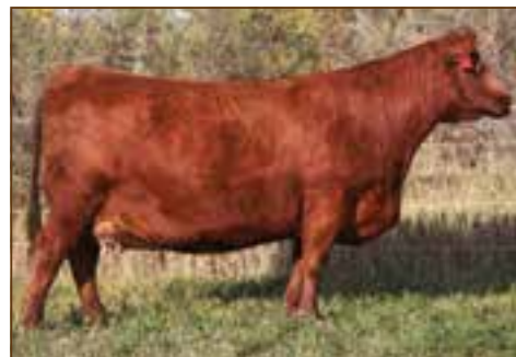
TNTS MISS U147