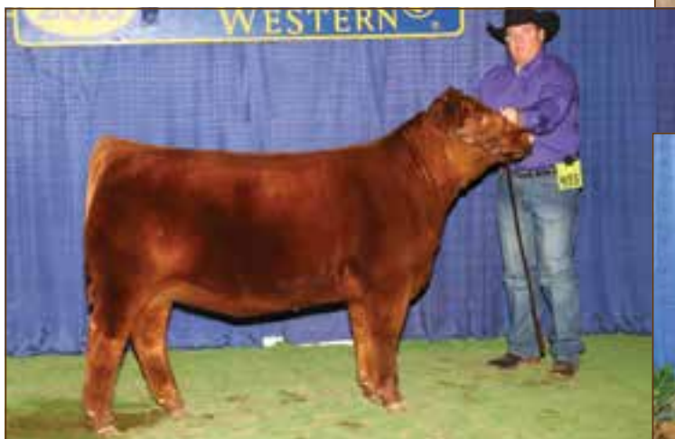
RED BLAIRS YANKEE 36Z 2012 High-Selling Daughter