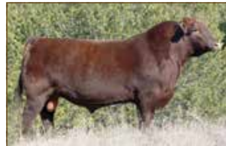
RED LAZY TROOPER 21Y • Sire of Lot 30B