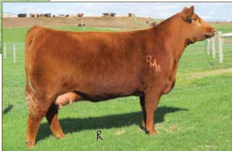
DAMAR MIMI W085 • Dam of Lot 17