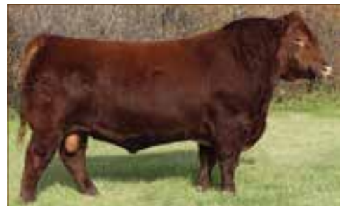
PIE SPECIALIST 430 • Sire of Lot 28B

Selling Four embryos with a guarantee of Two pregnancies if implanted by a certified embryologist.