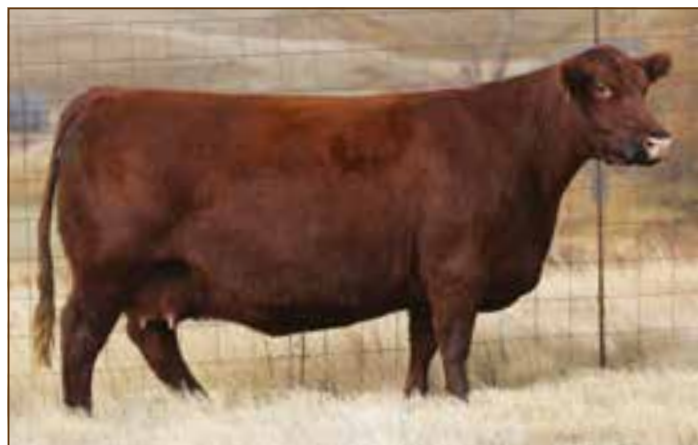
RED SIX MILE ENID 878W