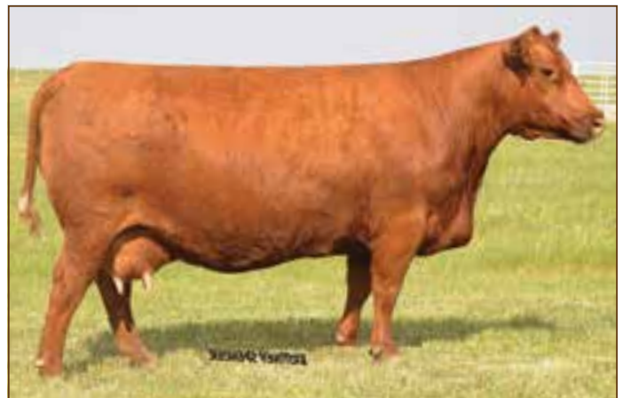
BKT LARKEISA M288