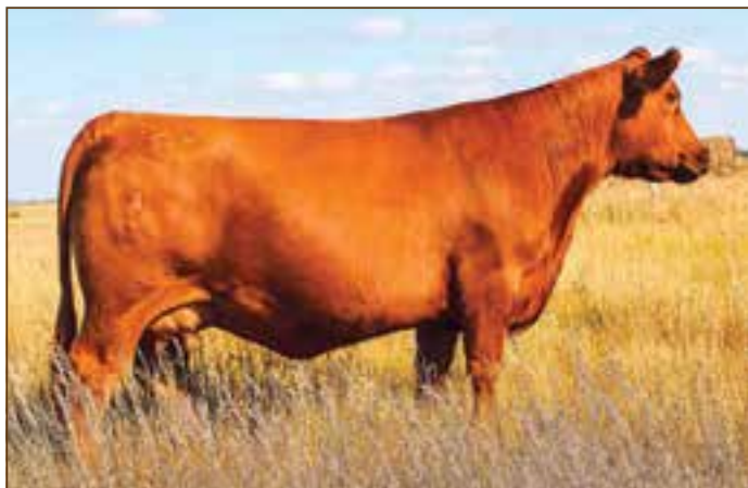
JD CATHY 859