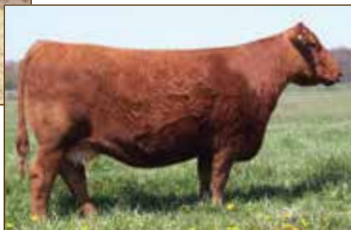
3R MS TOUCH 51H 21M