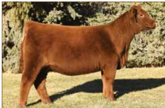
RED BLAIRS J6 JC CITA 860E

This is an unprecedented opportunity to obtain a female or bull that is backed with years of the most comprehensive genetics in North America. The females and bulls that carry the Blairs.Ag Cattle Co. moniker have been in amazing demand when offered at auction. This 2018 heifer calf pick or 2018 bull pick is one of the most historic opportunities made available to the buying public. Endless possibilities accompany the individual selected to represent this sale lot.