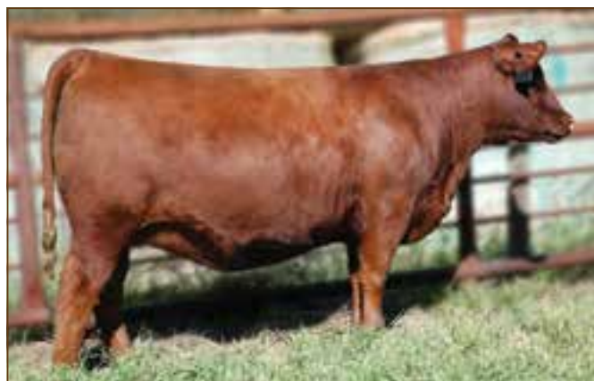
RED SSS MAXZEEN 694A