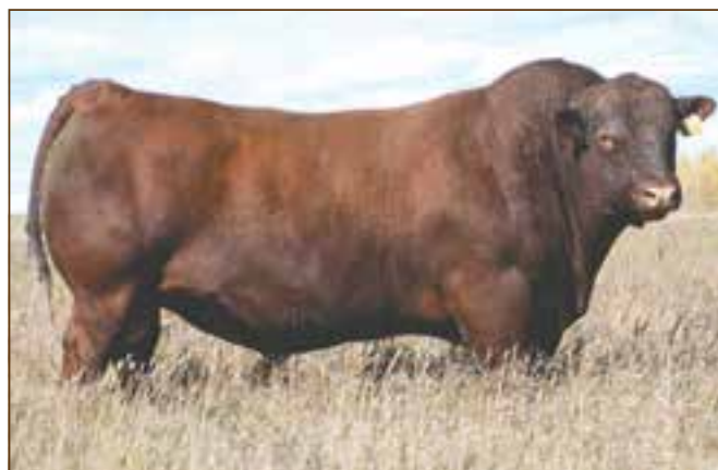
RED FLYING K MAX 159Y