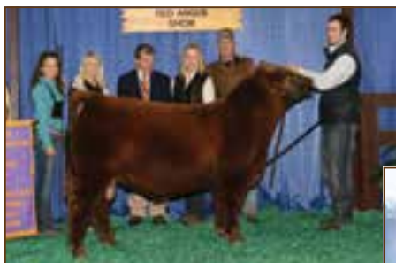
DAMAR MIMI E381

Tremendous earning power exists with this sexed heifer calf pregnancy offered by Polzin Cattle.