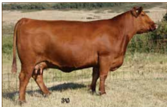
RED SIX MILE SHAWNEE 116T