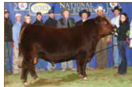
MRLA NEW ERA 87Y • Sire of Lot 25B

S A V NET WORTH 4200 RED BROX MS CHEROKEE 13N RED SODER CANYON 126M RED NORTH PEACE 11N RED SIX MILE ULTIMATUM 409U RED SIX MILE SHAWNEE 116T LCHMN RED SPREAD 1271F RED SIX MILE MS. UMPIRE 279P