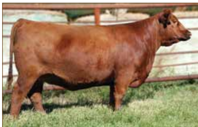
RED SSS LARKABELLE 616A