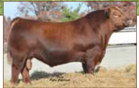
SILVEIRAS MISSION NEXUS 1378 • Sire of Lot 27