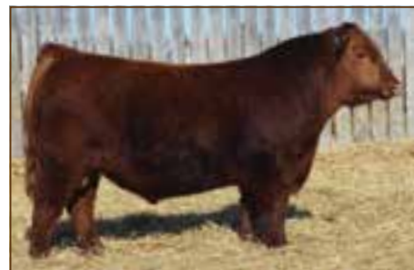
RED COCKBURN ASSASSIN 624D • Son of Lot 27