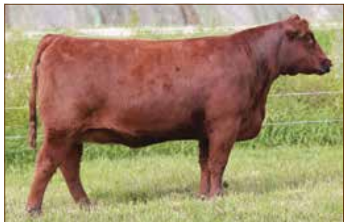
RUST MISS 329A