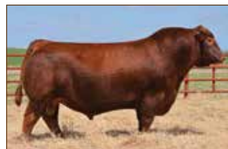
RED BLAIRS BINGO 581B • Sire of Lot 26C