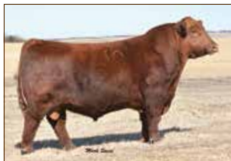
PIE THE COWBOY KIND 343