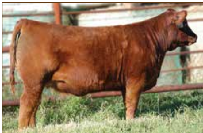
RED SSS DUCHESS 142B