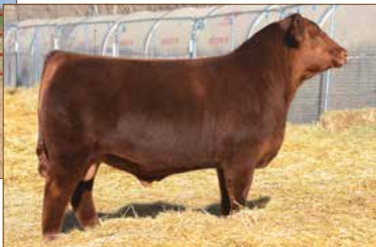
RED BLAIR'S KONGO 580D $37,500 Son