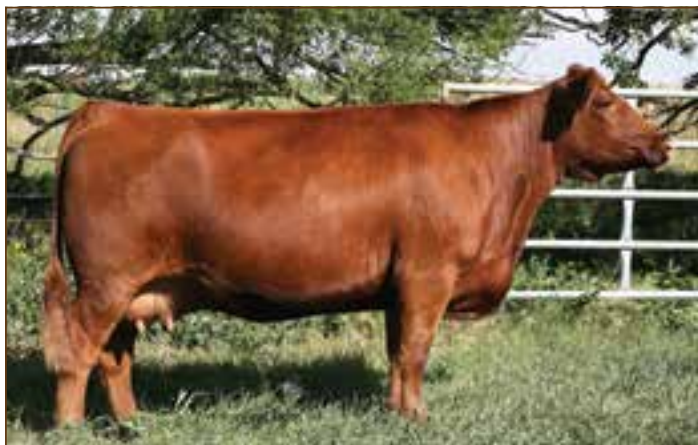
RED SIX MILE LASSIE 377P