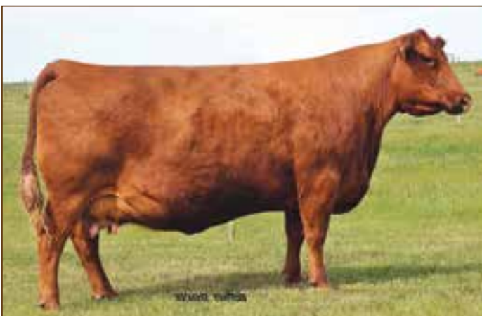
RED COCKBURN MS FANNY 191M