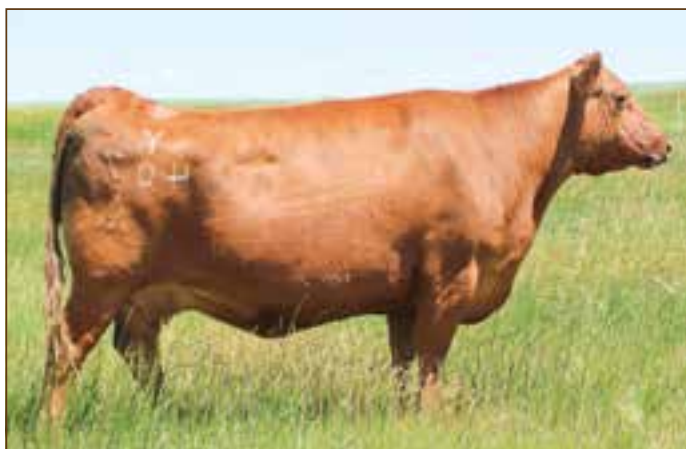
BASIN PRIMROSE 4167