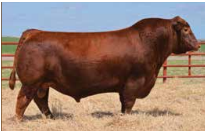
RED BLAIRS BINGO 581B