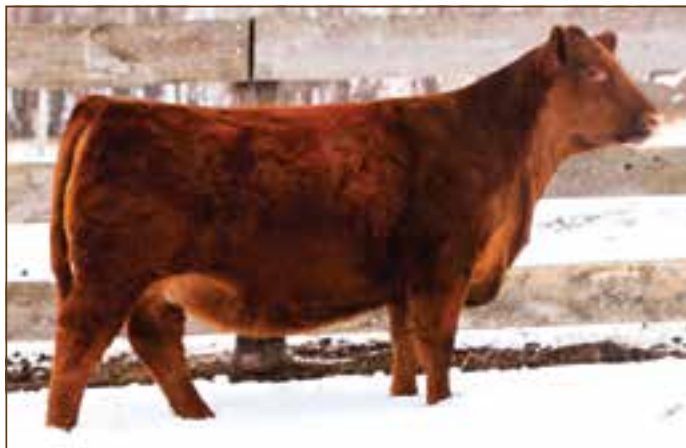
RRED FLOWERS 514C