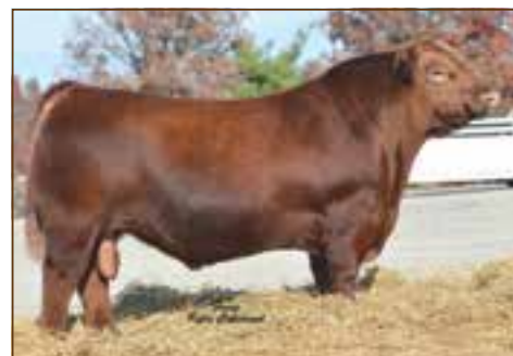
SILVEIRAS MISSION NEXUS 1378