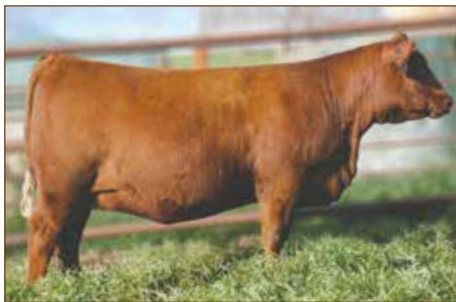
RED SSS GOLDEDGE 206B