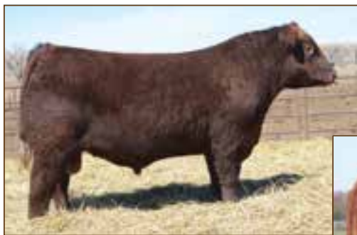
PZC TMAS RED ZONE 2795