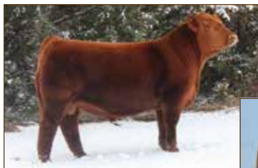
AHL FLASHBACK 446B Full brother to Lot 10

AHL Duchess 42W is one-in-a-million Red Angus donor female. Her accomplishments and breeding value as a genetic contributor to the absolute top of the Red Angus breed is well-documented in the American Red Angus Association herd book. She is the product of decades of selective mating that has resulted into the genetic superiority that has produced some of the most breed-leading individuals known to the industry.