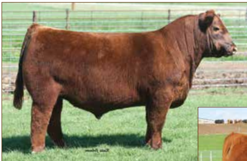
PZC TMAS FIRESTORM 1800 ET • Sire of Lot 17