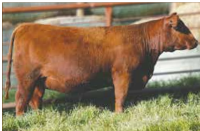
RED SSS DUCHESS 140B

The Arrowsmith Red Angus breeding program began in 1994 when Brad purchased his first Red Angus female. Before that, Red Angus bulls had been used on the existing Hereford cow herd, and the influence of the Red Angus genetics on the commercial cow herd encouraged Brad Arrowsmith to pursue breeding Red Angus seedstock. Since the initial movement toward breeding Red Angus breeding stock, The Arrowsmith brand of excellence has been a part of all decision making. From purchases to selection, from performance traits to maternal background, from freshness of pedigree to durability of proven lines, Brad Arrowsmith is constantly striving to improve. His goals of a herd of Red Angus females that excel in phenotype, soundness, udder quality, longevity and outcross lineage has become a reality. The herd ranks as one of the greatest breeding herds in North America.