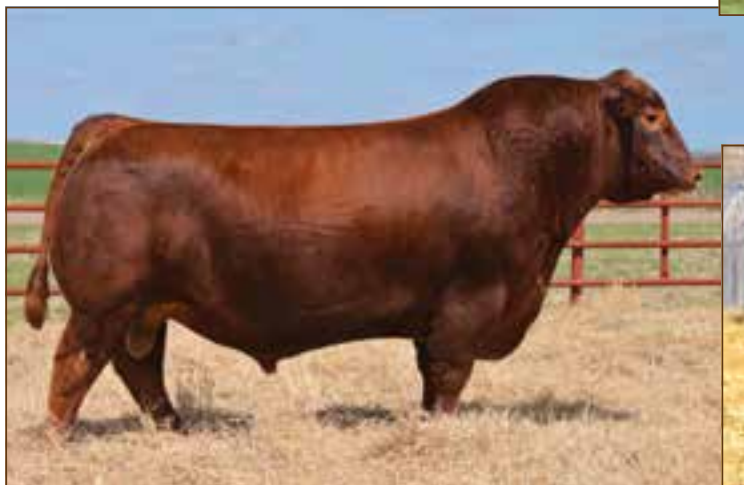
RED BLAIR'S BINGO 581B $60,000 Son