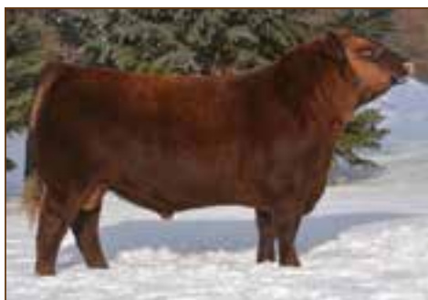
DAMAR TRUMP C512