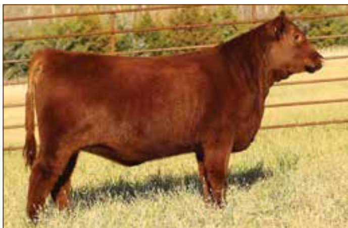
CINCH x PRIMROSE 0T43