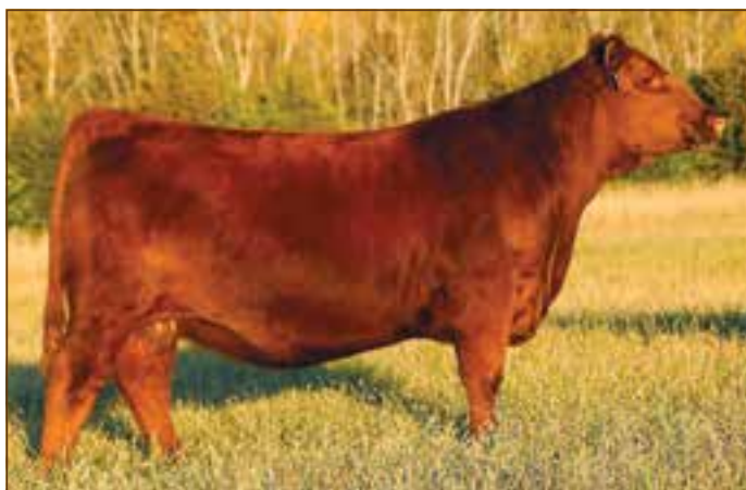
RREDS TILLY 515C