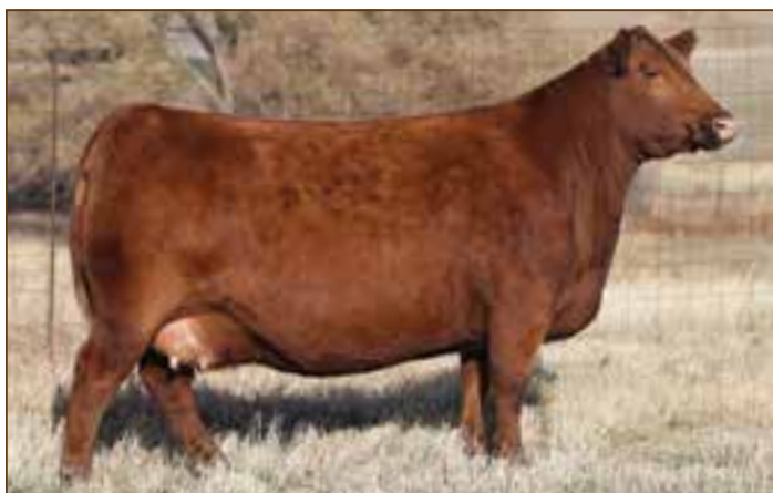
RED SIX MILE TAFFETTA 142B