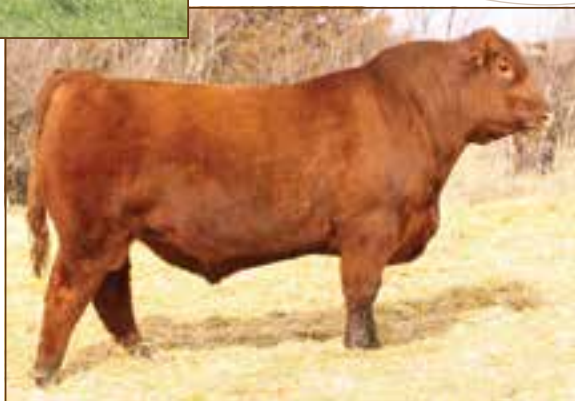
RREDS PIONEER 6904