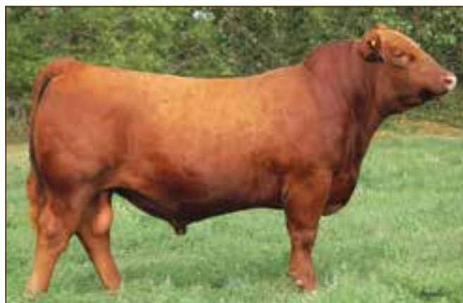
WPRA LEGACY A-314 • Sire of Lot 32

LAZY MC LOOKOUT 37U RED LAZY MC GOLD DESIGN 68U BFCK CHEROKEE CNYN 4912 ER EVERLEDA ENTENSE P578 HXC HEMI 4400P HXC JOLENE 301N RED BRYLOR NEW TREND 22 RED SIX MILE LANA 202P