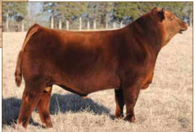
RED SOO LINE POWER EYE 161X • Sire of Lot 31B