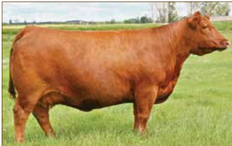
WSF MS YANKEE 13T 12W

RED WILD ROSE ROBINHOOD 11F RED BAR EL SYBIL 122E RED BRYLOR DYNASTAR 19S RED STEN ESSENCE 42G RED COMPASS MULBERRY 449M RED DUS FAYETTE 8G RED SSS EQUAL 508N RED T-S YANKEE 303M