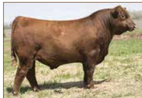
PIE CINCH 4126