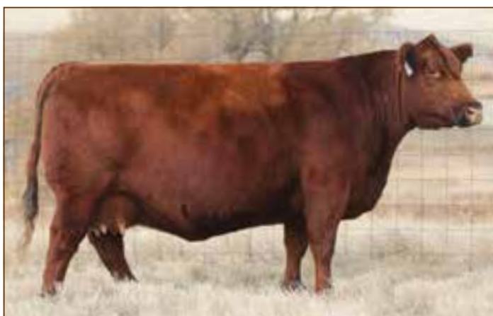
BAR-E-L FRADO 209U

Six Mile Red Angus has been in the Red Angus breed since 1968. Since the very beginning, our program has been "Focused on the Female" and we believe in the power of cow families. The Six Mile Red Angus cow herd numbers around 500 head—giving the buyer ample opportunity and variation of choice. The recent accusation of females from the Bar-E-L Red Angus herd dispersal in Canada, has added even more genetic opportunity. Your choices include many National Champion females, dams of Denver Champion bulls and countless high-selling females. We have many up-and-coming young females, along with proven mother cows. Cows that have proven themselves on the range and in the sale and show ring.