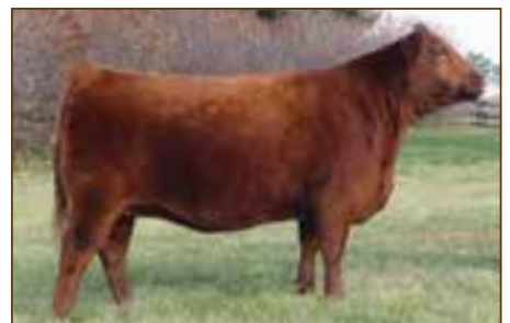
RED COCKBURN CORA 501C • Daughter of Lot 31B

Red Cockburn Cora 254Z is the $20,000 half interest female that was one of the high-selling lots in the Pinnacle Sale this summer. Polzin Cattle made the purchase, and the genetic combination with Silveiras Mission Nexus 1378 is a headliner embryo lot in the Western Heritage Sale.