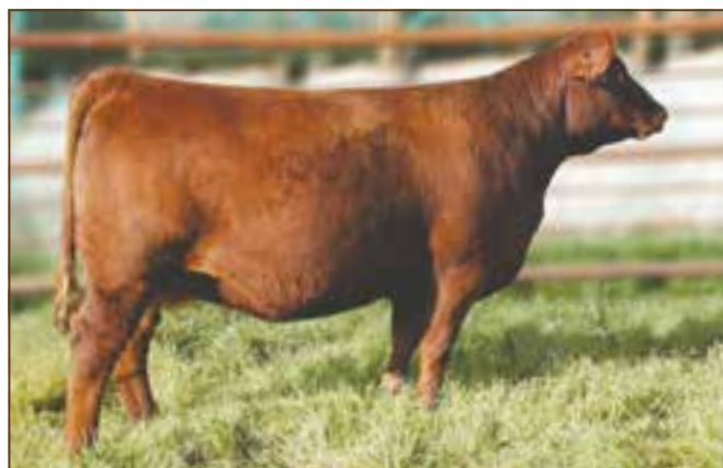
RED SSS ELBA 115B