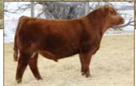
SIX MILE TAURUS 519A • Sire of Lot 30A