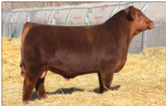
RED BLAIRS KONGO 580D