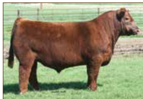
PZC TMAS FIRESTORM 1800ET