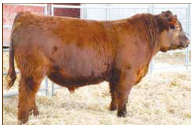
RED SSS ENDORSE 639X