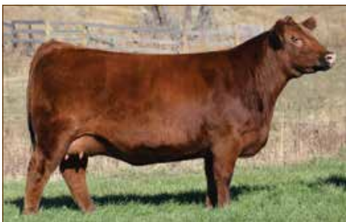
RED SIX MILE GLORIA 195B