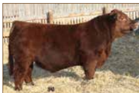
RED U-2 RECKONING 149A • Sire of Lot 25A

RED U2 MISSION 61W RED U-2 LARKABA 8133U RED HOWE MAGNUM 169W RED U-2 ANEXA 333N RED SIX MILE ULTIMATUM 409U RED SIX MILE SHAWNEE 116T LCHMN RED SPREAD 1271F RED SIX MILE MS. UMPIRE 279P