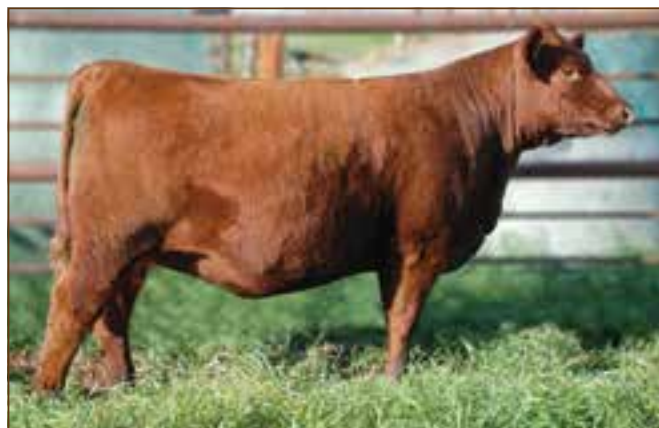
RED SSS LYDA 265B