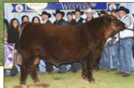
DAMAR TRUMP C512 • Sire of Lot 26A