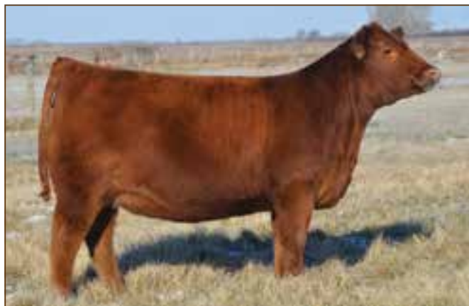
RED BLAIRS BONITA 179A