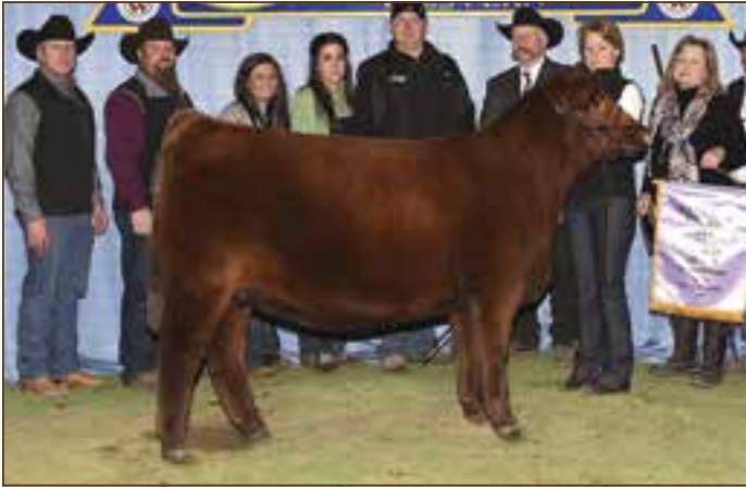
ROJAS NAVARRE 6054