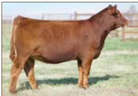
U2 DOLLY PYTHON 263B