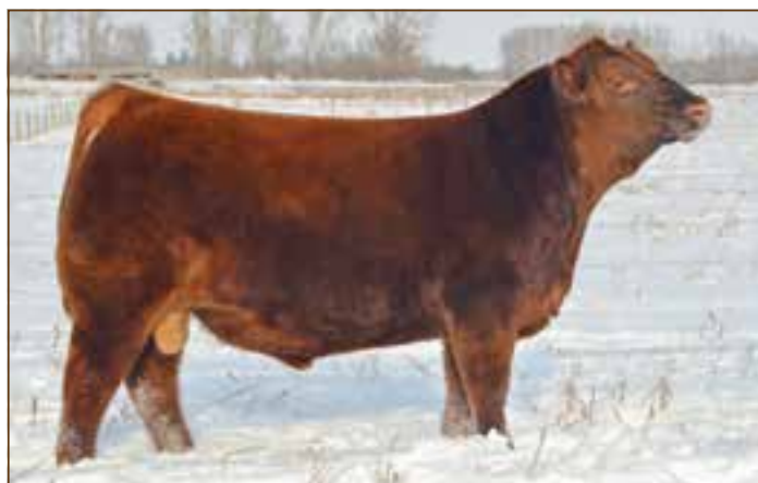
RED BLAIRS PURE POWER 2B