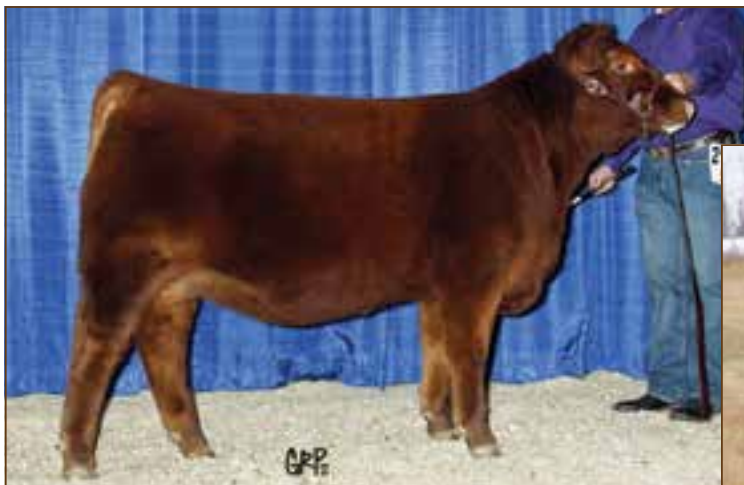
RED BLAIRS SWEET CHEEKS 8Y $18,000 Daughter