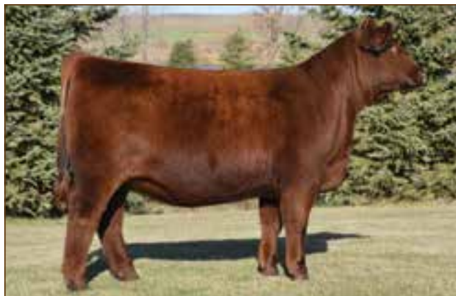
RED BLAIRS RUST LARKABA 502D