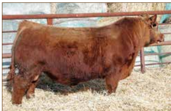
RED SSS TACTIC 651D