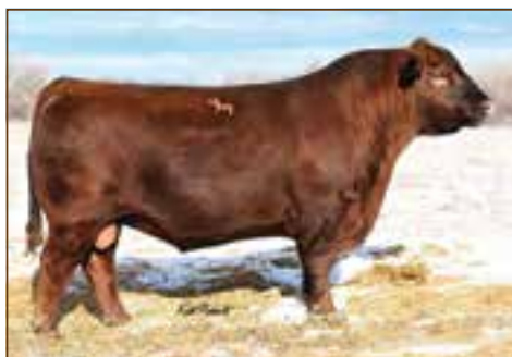
RREDS SENECA 731C