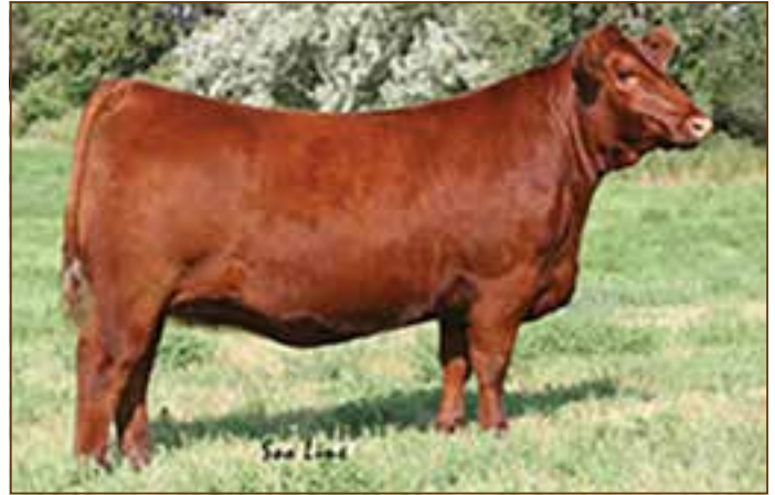
RED SOO LINE ANNIE 8192