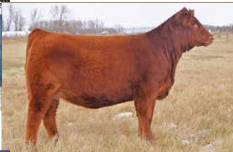
RED BLAIR'S YANKEE 28B $7,000 Daughter