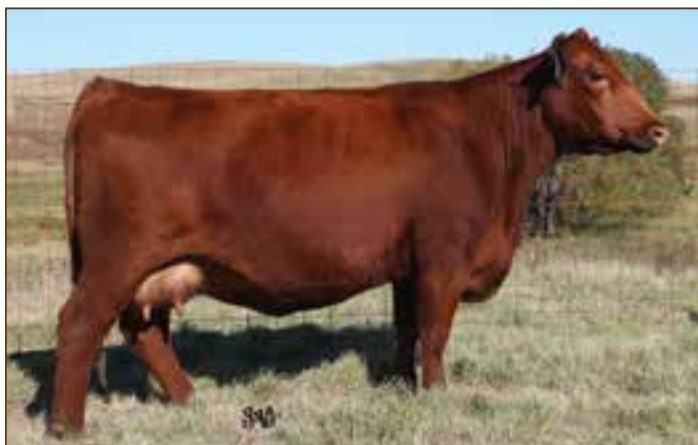
RED SIX MILE MARTA 300Y