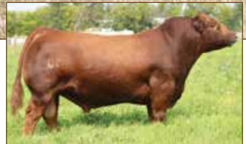
RED COCKBURN HEAVY DUTY 518C • Sire of Lot 28A