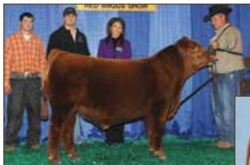
AHL FLASHBACK 446B