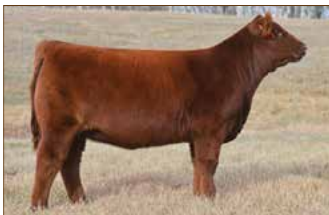
RED BLAIRS KASSIE 49E